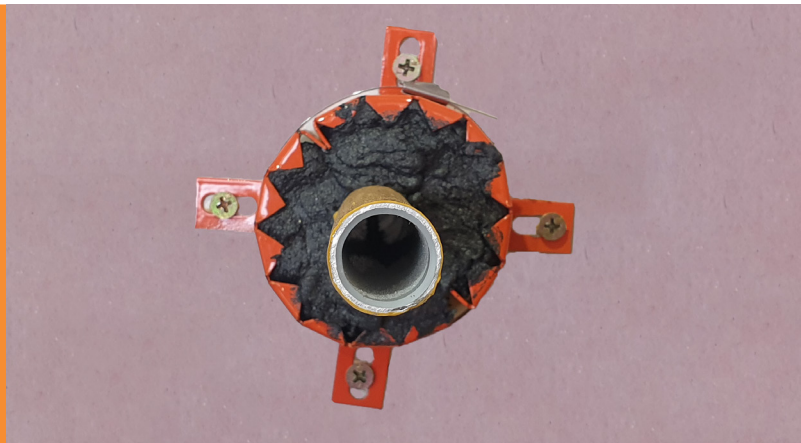
FyreSHEATH is a two part metal shell that is affixed to walls and filled with FyrePEX HP Intumescent sealant to fire stop PEX pipe penetrations