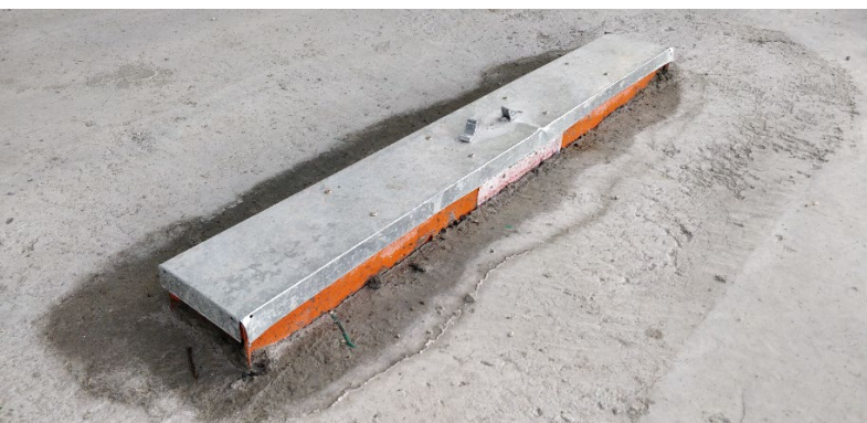
Image shows FyreBOX™ Cast-In in freshly poured concrete slab ready for the lid to be removed and services run.