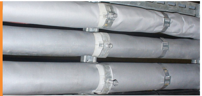
Cable bundles wrapped in svt Pyro-Safe DG-CR cable wrap