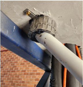
PVC Pipes 40-100 mm - with elbow