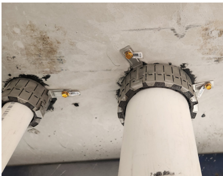
PVC Stack pipes 40-100 mm