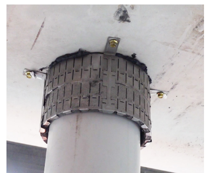
PVC-150 (Double collar stacked)