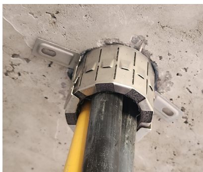
PEX-A, PEX-B and PEX-AL-PEX (Wrap Free)